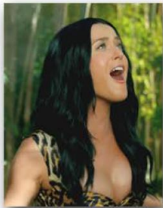
KATY PERRY ROAR (2013)

Language, Representation, Industries, Audience