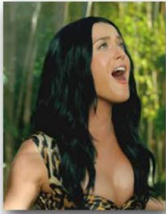
KATY PERRY ROAR (2013)